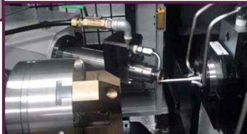
Pneumatic positioning slide for dresser