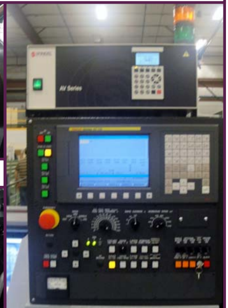
Fanuc 0i TD CNC control and dresser drive panel

System features: MicroCentric pneumatic sliding jaw chuck, Weldon heavy-duty workhead, GMN 90,000 RPM high frequency grinding spindles, Heidenhain rotary and linear glass scales, Monlan PFA-80 coolant filtration system, Airflow MP4 media type mist collector, and Fanuc 0i TD CNC control.